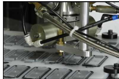
Robotic Form-in-Place Gasketing

Call Radco Industries today at 419-531-4731 or visit www.radcoindustries.com